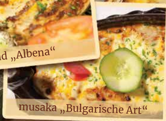
musaka „Bulgarische Art“