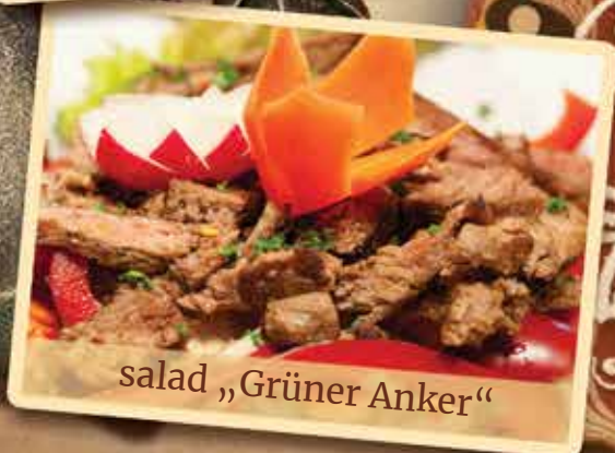
salad „Grüner Anker“