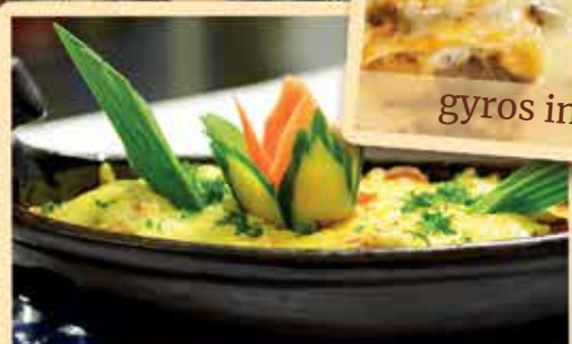
chicken fillet in the gondola

For adjustments we charge an extra charge of 1,20€. With the starters we serve bread.