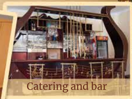
Catering and bar