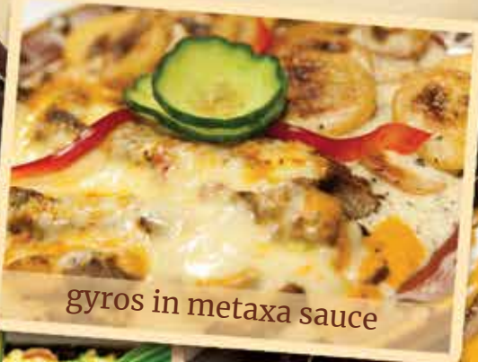
gyros in metaxa sauce